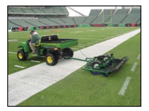
Grooming the field to prepare for game day.