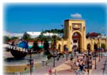
Orlando/Orange CVB, Inc.®

January's average high temperature: 70.8 degrees. Average low temperature: 48.6 degrees. Mornings, evenings and meeting rooms can be cool, so pack a light jacket or sweater.